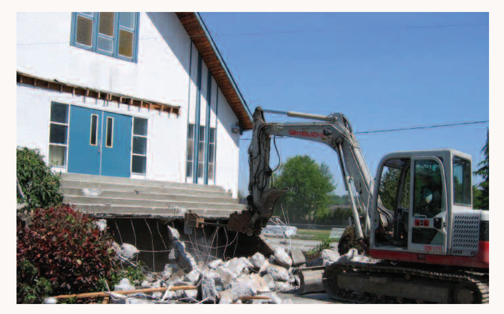
Bulldozing the front steps.