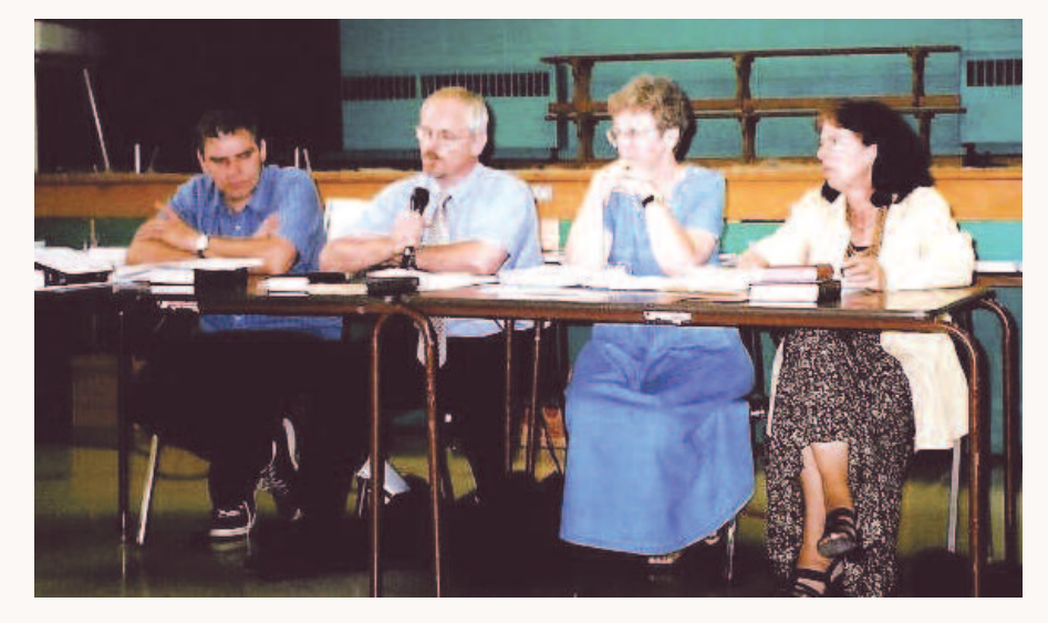
The question and answer panel

implemented this year; some managed to do a bit of everything!