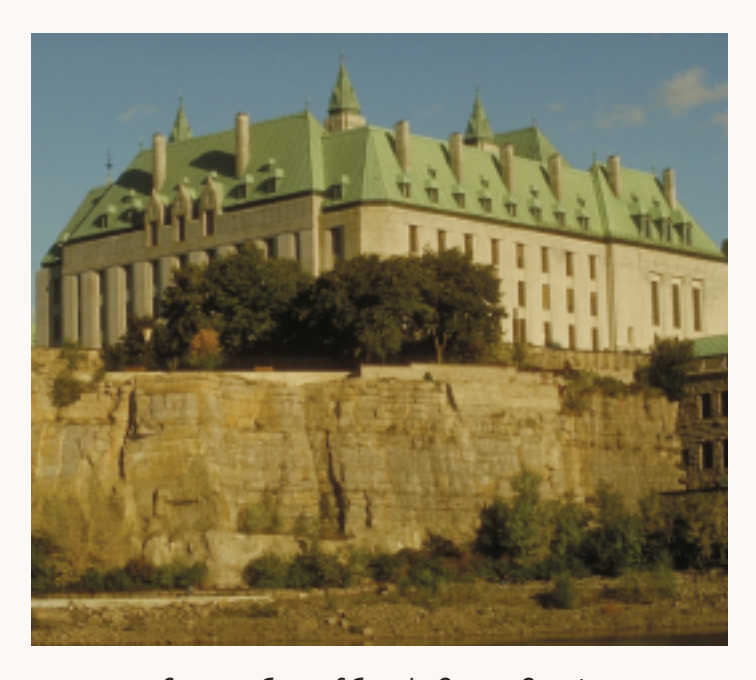
Supreme Court of Canada, Ottawa, Ontario

In the mean time, however, how do we respond to sin all around us? By promoting the right kind of knowledge.