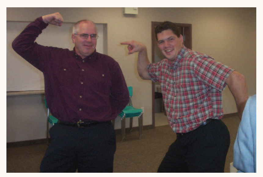
Two B.C. ministers