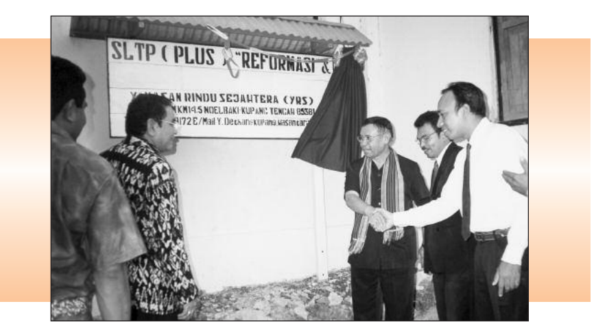
Unveiling the school sign. To the left of the sign – head of the region; to the right of the sign – head of the M.P.s in the province.

The report tells us that ever since the church federation had been established in 1950, their children had to go to public, Roman Catholic or even Muslim schools. The funds were not there but a desire to educate their children on the basis of the Scriptures and Reformed Confessions grew. With much prayer for wisdom and the help of many people in Canada they were able to first start a kindergarten in one of their church buildings, namely in Tarus. Then in 2001 they started collecting funds from their own members. They worked very hard cooking and selling meals as well as selling calendars and book dividers with the name of their school on them. They also organized a sale of items made from traditional cloth, such as ties (which the ladies sewed themselves), Bible covers,