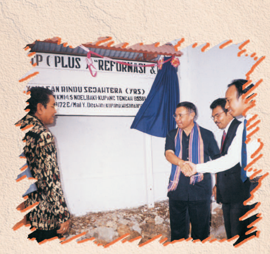
Christian Education in Timor