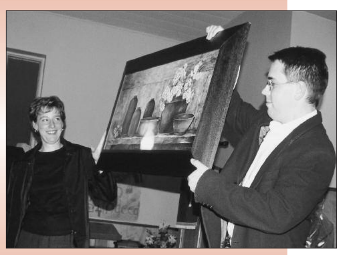
Yes . . . we like it!

of churches. Altogether, it was a wonderful day, one that demonstrated the amazing gifts that God has given to us.