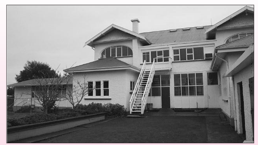
The meeting place for the church at Masterton can be seen on the left of this backview of the school.