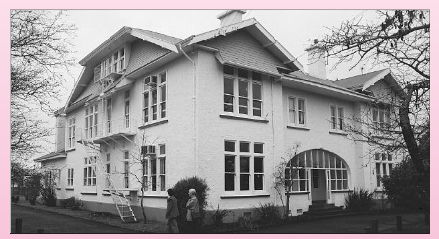
The Reformed school at Masterton has its home in a building that used to be an orphanage.

from the beginning, there was a congregation which included the Westminster Confession of Faith besides the Three Forms of Unity as their confessional basis.