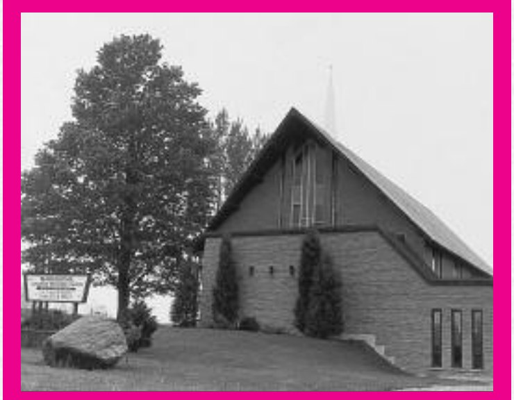
Fergus, Ontario – Site of General Synod 1998

THE CANADIAN REFORMED MAGAZINEVOLUME 47, NO. 5MARCH 6, 1998