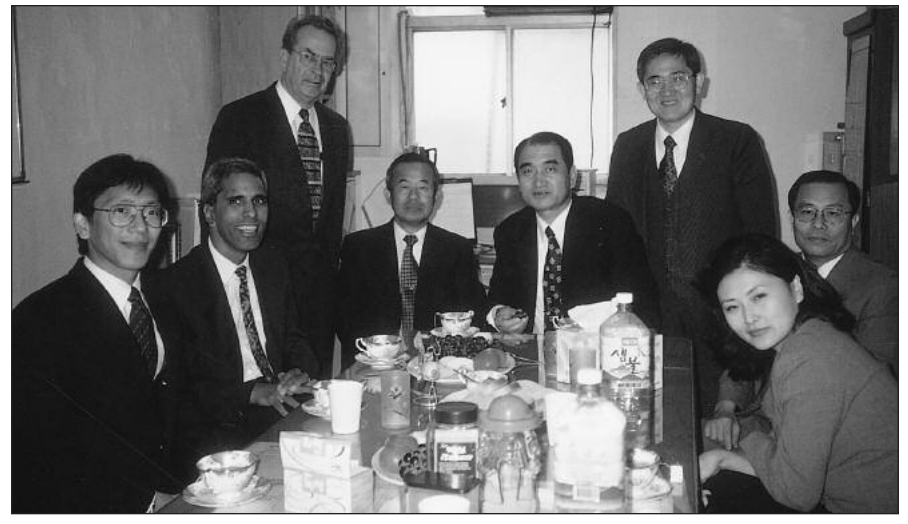
Visiting ministers and some consistory members being served lunch in consistory room between Sunday's services.

on the Principles of Reformed Missions. In his presentation he stressed that it has pleased God to entrust to the church the effectual means necessary for His church gathering work: the preaching of the Word. In His Word the elders are fully supplied with all that is necessary for them to carry out this task. He cautioned against becoming dependent on para-church organizations which ultimately are not responsible to any particular church.