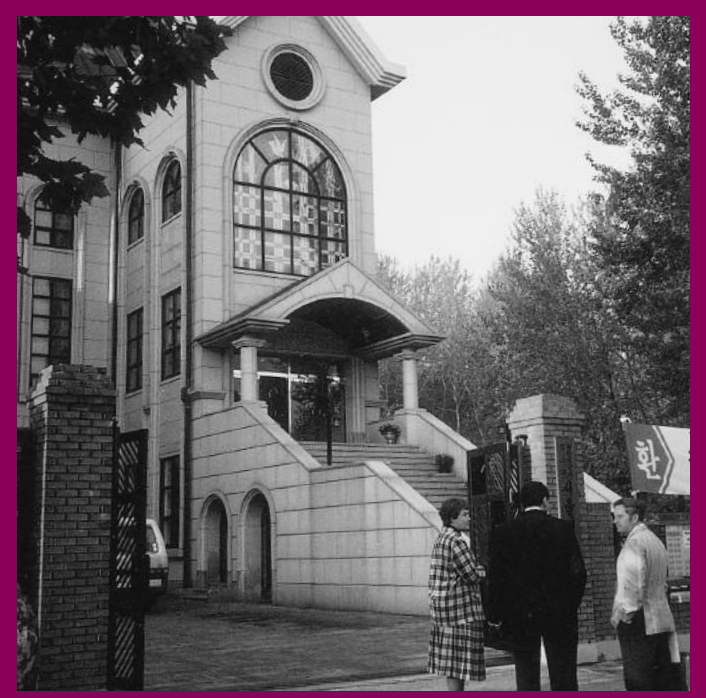
ICRC Conference, Seoul, South Korea Seo-Moon Presbyterian Church

THE CANADIAN REFORMED MAGAZINE VOLUME 46, NO. 24 NOVEMBER 28, 1997