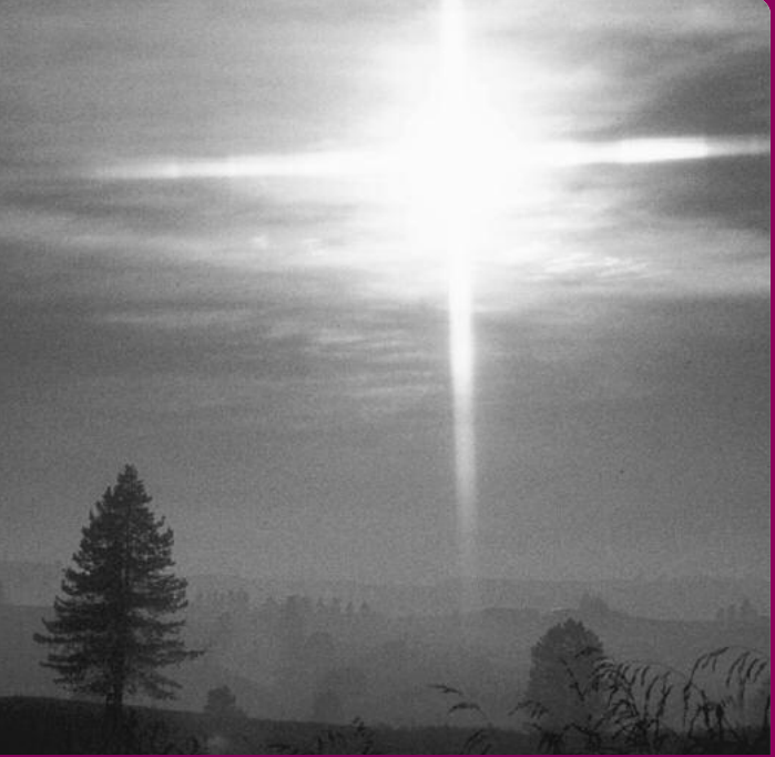
Drenched with the Spirit

THE CANADIAN REFORMED MAGAZINE VOLUME 45, NO.1 JANUARY 12, 1996